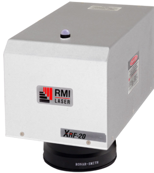
Laser Marker Head